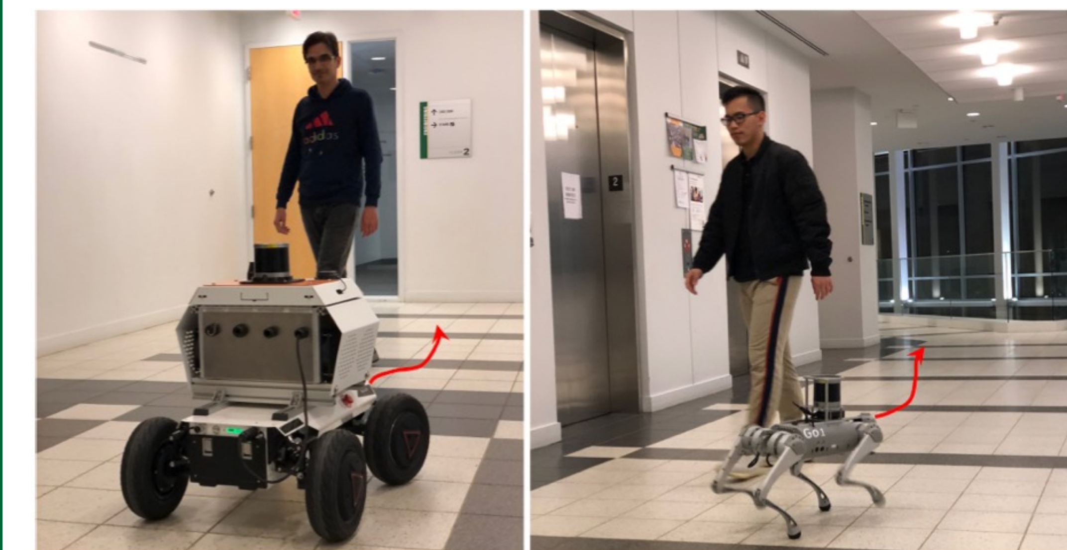
Learned Obstacle Avoidance Behavior from MuSoHu

The learned policies from MuSoHu are implemented on two physical robots, a wheeled and a legged robots. Both robots demonstrate collision avoidance behavior based on the policy learned from MuSoHu.