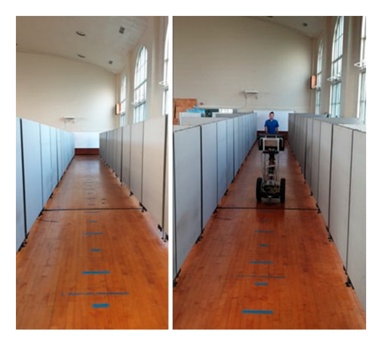
Fig. 2. The hallway constructed for this experiment (left) and a snapshot of the experiment during execution (right).

to the front of the robot. When signaling, the robot turns its head 16.5^{\circ} and remains in this pose. The eyes are not animated to move independently of the head. The head turn takes 1.5 s. These timings and angles were hand-tuned and pilot tested on members of the laboratory. The gaze signal can be seen in Fig. 4 (left).