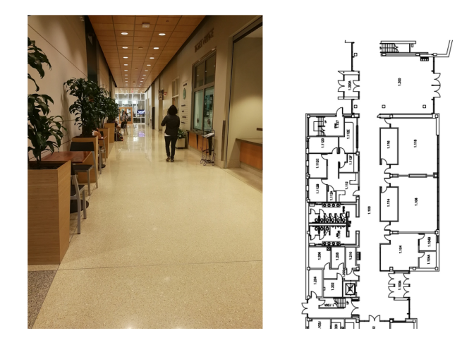
Fig. 1. The hallway in which the human field study took place.

This study was performed in a hallway at UT Austin which becomes crowded during class changes (see Fig. 1). Two of the authors trained each other to proficiently look counter to the direction in which they walk. They acted as confederates who interacted with study participants. Both of the confederates who participated in this study are female. A third author acted as a passive observer (and recorder) of interactions between these confederates and other pedestrians.