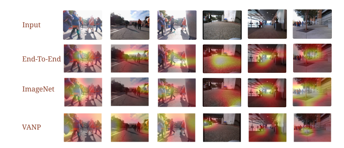
Fig. 3: Qualitative Comparison. Comparison of the last layer activation maps among different methods on unseen scenarios.

However, we do not see such an improvement in the case of VANP. The negligible improvement in accuracy from 0.383 to 0.338 for VANP during fine-tuning can be attributed to two reasons. First, the focus on multiple navigation-related visual regions of VANP's pre-trained weights (Fig. 3 last row) impedes adaptation/forgetting during fine-tuning compared to the ImageNet weights. Second, the temporal features from the Transformer are already in VANP weights and therefore does not require much fine-tuning. Overall, it is likely that forgetting/updating weights can be easier when the visual encoder is trained using only one single