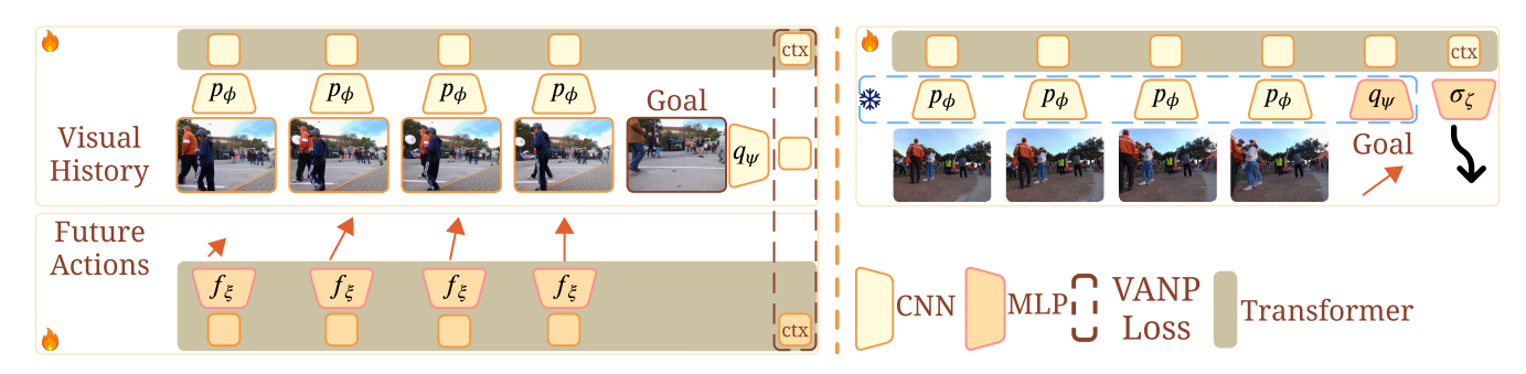
Fig. 2: VANP Architecture. VANP learns to embed temporal features into spatial features by using a sequence of images and leveraging two TransformerEncoders with context tokens by maximizing the mutual information between history, future actions, and the goal (left). Then, by appending an MLP to the Transformer context token, VANP predicts future trajectories during the downstream navigation task (right).

as a_{t:t+\tau_F}^i to f_\xi as part of another transformer encoder, to learn image Z^i and action Z^a embeddings, respectively. Each transformer contains an additional context token to capture the continuous information among frames. We feed g_t^i to p_\phi to generate goal embedding Z^g . Finally, we use VANP's objective function to learn \phi and \xi :